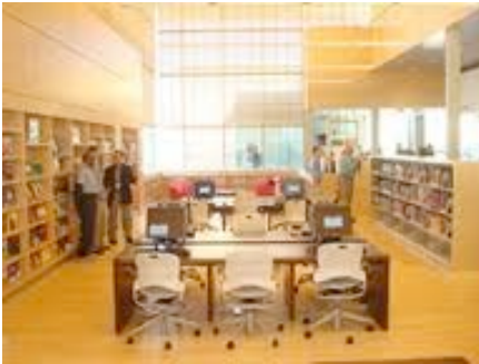
Facing toward the computer tables and the corner couches

Like the other patron rooms, the main reading room (for adults) is divided into sections, with couches in the front corner, four rows of computers beyond, individual study tables along the front wall, and the reference desk in the midst of this area. Most of the back section of the room is filled with book and DVD shelving, with lower shelves near the circulation desk and higher shelves in far end of the room.