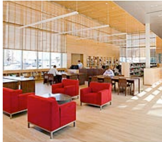
Looking toward the glass-enclosed front wall. The reference desk is in the center, beyond the red chairs.